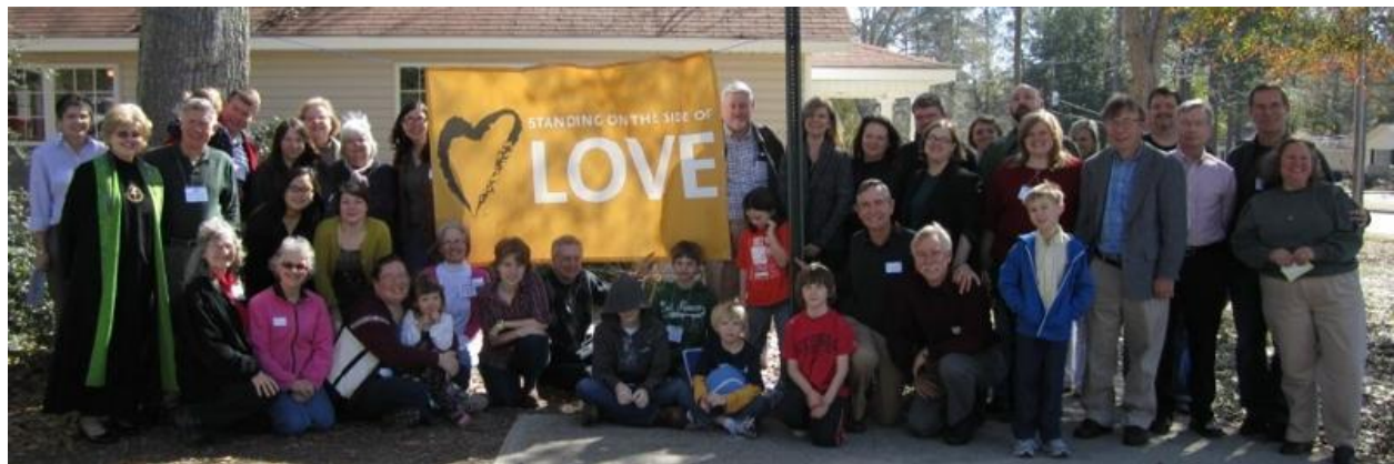
Congregation with SSL Banner February 2011