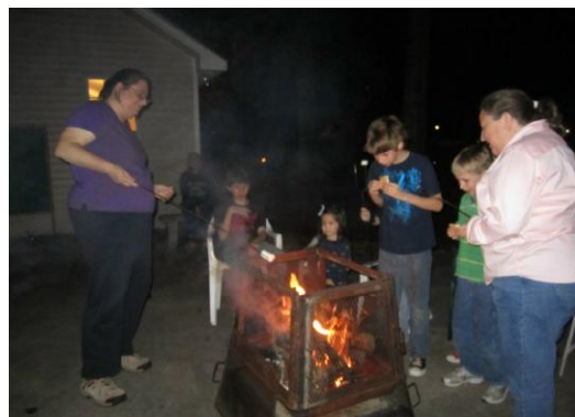
Children's Party Bonfire – February 25, 2011