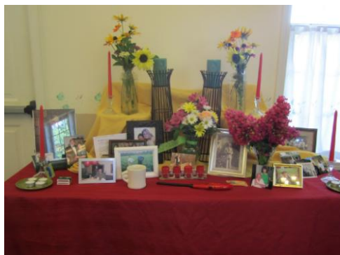
Father's Day Altar