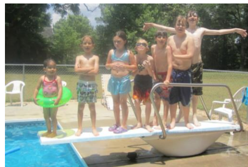
Diving into summer on the diving board