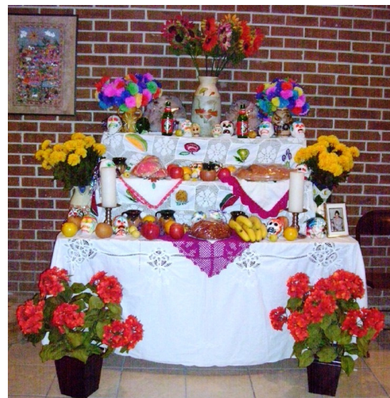
Altar of foods constructed for Day of the Dead service.

Sponsored by the Unitarian Universalist Campus Ministry