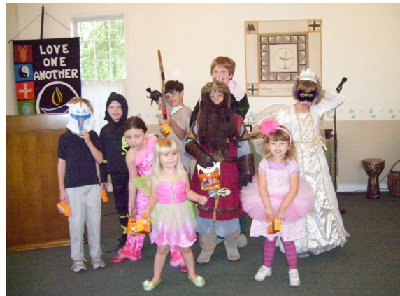
Children pose after trick-or-treating for UNICEF on October 31.